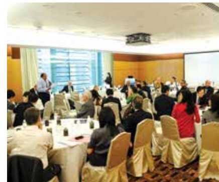
Committee sessions included this innovative round-table discussion, which was well received by those who attended.