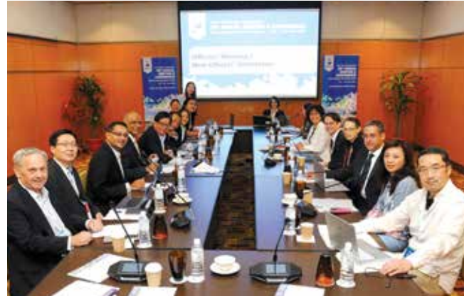
The Officers and Officers-to-be were hard at work prior to the conference.