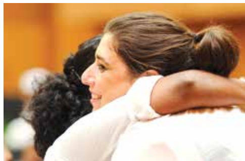
The IPBA spirit of camaraderie and friendship is clear in this picture.