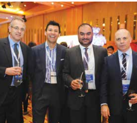
Delegates enjoyed, food, drink, entertainment, and various crafts at the Welcome Reception.