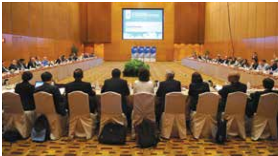
The IPBA Council met the day before the start of the conference.