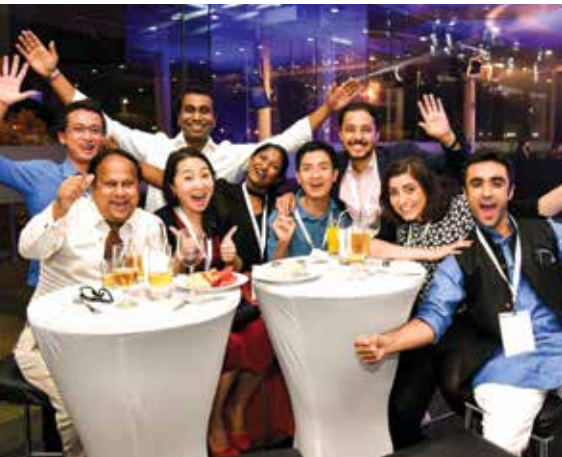
IPBA Scholars from nine different jurisdictions were chosen to attend the conference this year.