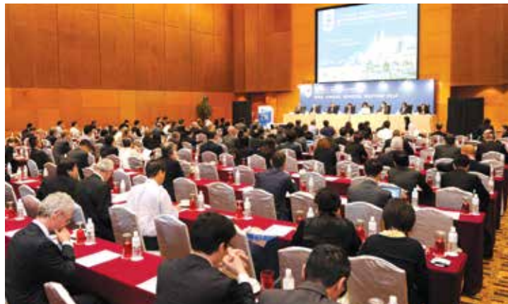
Over 200 members attended the Annual General Meeting (AGM) on the last day, where they heard the reports of the IPBA Officers.