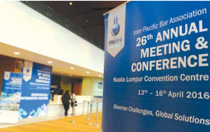
The conference was held at the Kuala Lumpur Convention Centre, at the foot of the iconic Petronas Twin Towers.