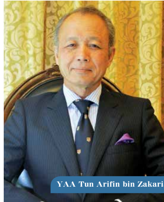
YAA Tun Arifin bin Zakaria

On Thursday, 14 April 2016, the Publications Committee of the IPBA was given a special opportunity to interview The Right Honourable Tun Arifin bin Zakaria, Chief Justice of the Federal Court of Malaysia for the IPBA Journal .