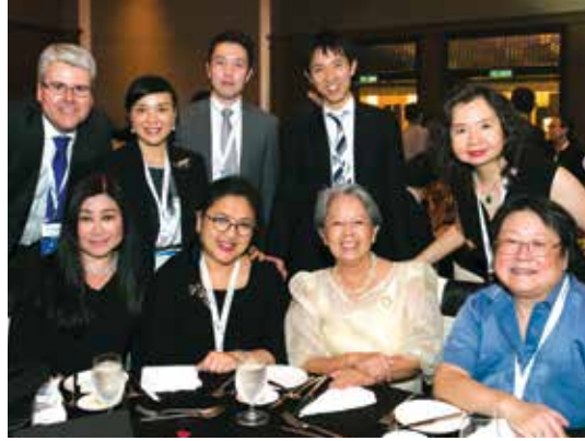
Our multinational membership is well represented by these Gala Dinner guests.