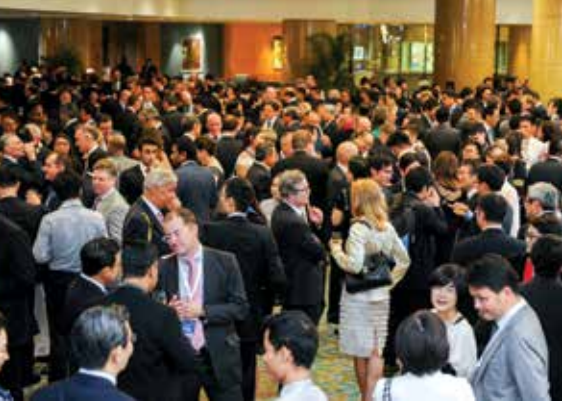
The Gala Dinner event drew a large, lovely, and lively crowd.