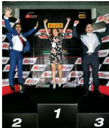
Everyone's a winner at the IPBA!