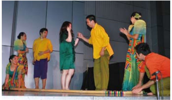
Learning the Tinikling, the Bamboo Dance