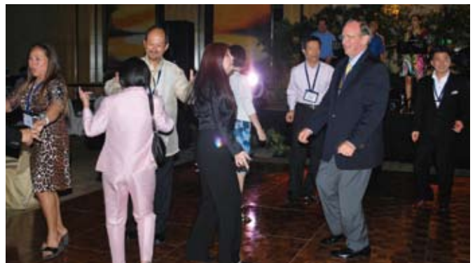
Dancing at the Welcome Reception