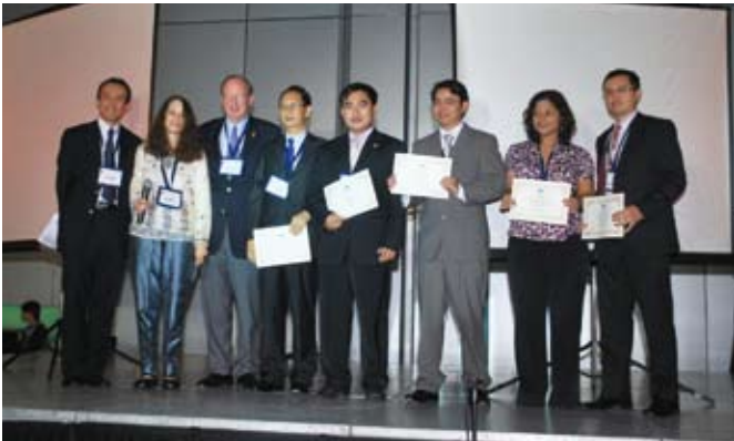
Awarding of certificates to the IPBA Scholars at the Farewell Gala at One Esplanade