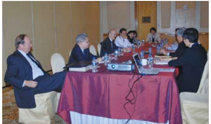
New Officers Meeting