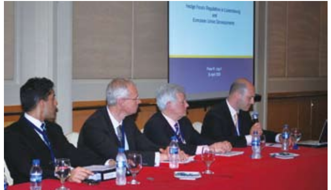
Panelists in one of the sessions