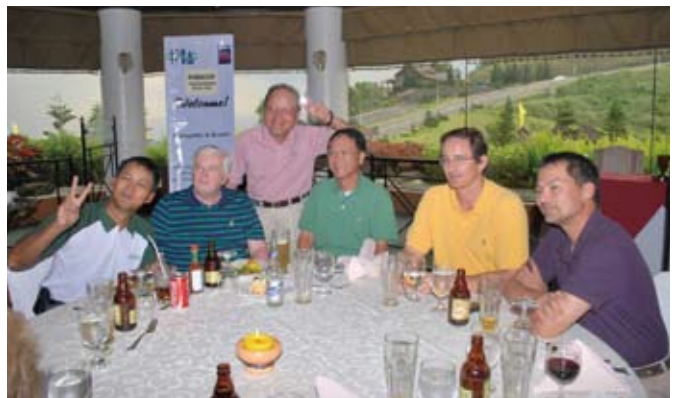
Taken at Tagaytay Highlands, the site of the Post-Conference Golf Tournament