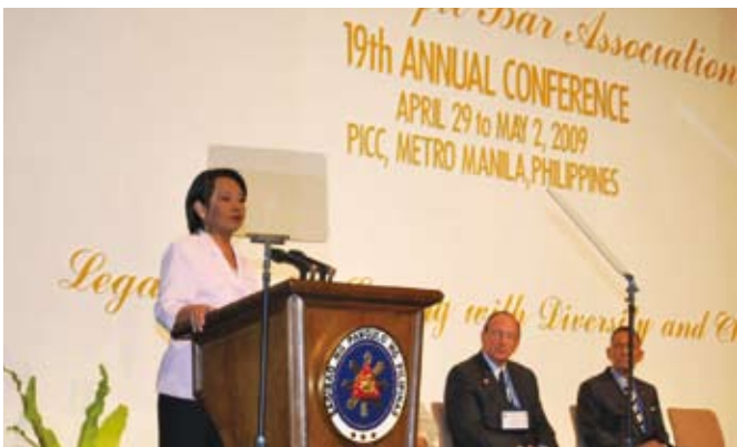
President Arroyo delivering her Keynote Address