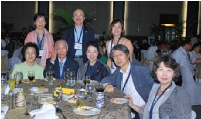
Taken at the Conference Gala at SMX Convention Center