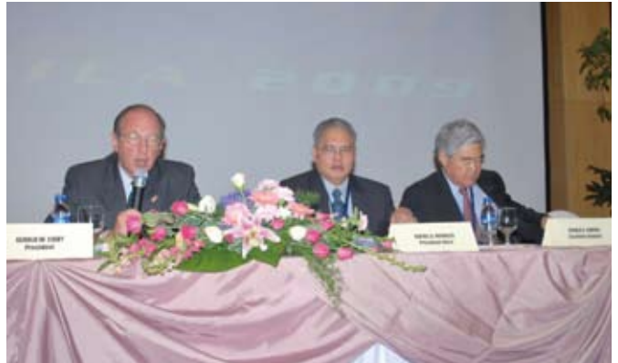
At the Annual General Meeting