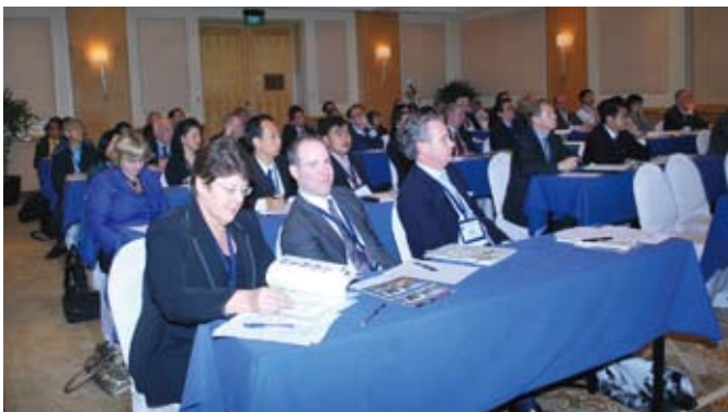
Scene from one of the concurrent sessions