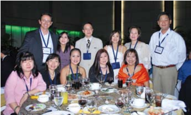
Still at the Conference Gala