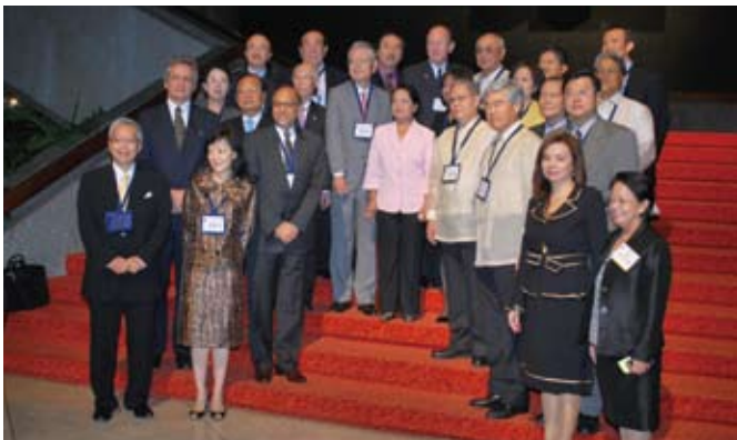
President Arroyo with the Officers and Past Presidents of the IPBA