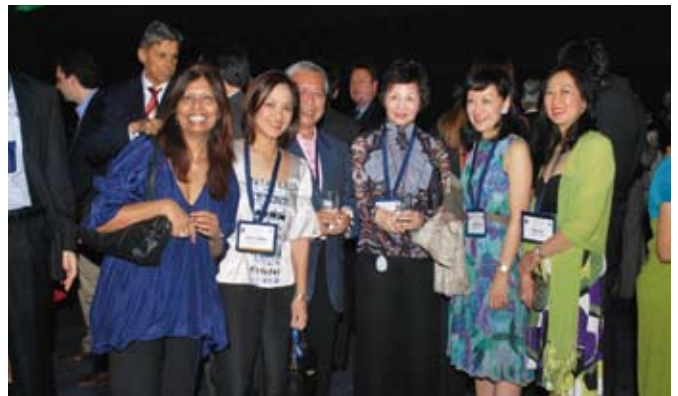
At the lobby of Sofitel Philippine Plaza