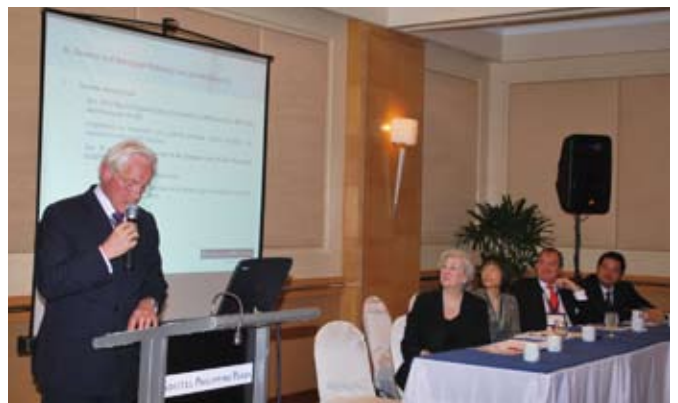
Another panel of speakers