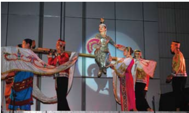
The Bayanihan Dance Troupe performing at the Farewell Gala