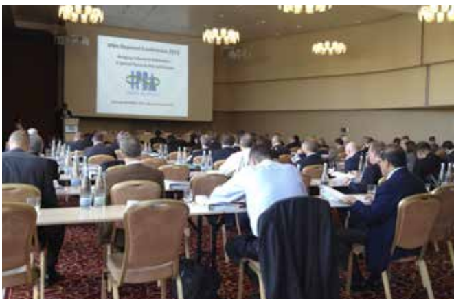
Four panels of experts from around the world addressed various topics at the conference, "Bridging Cultures in Arbitration – A Special Focus on Asia and Europe".

increase of the Swiss IPBA membership by more than 10 per cent as a number of participants who have not previously known the IPBA spontaneously followed the Host Committee's suggestion to become members.