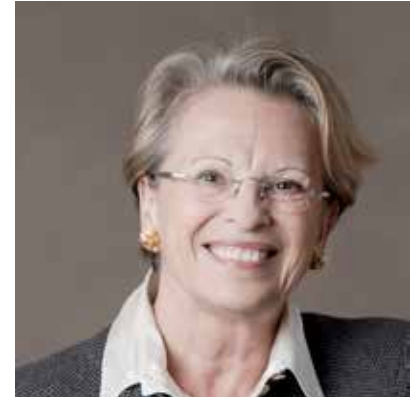
Law Professor and Attorney, Mrs Michèle Alliot-Marie