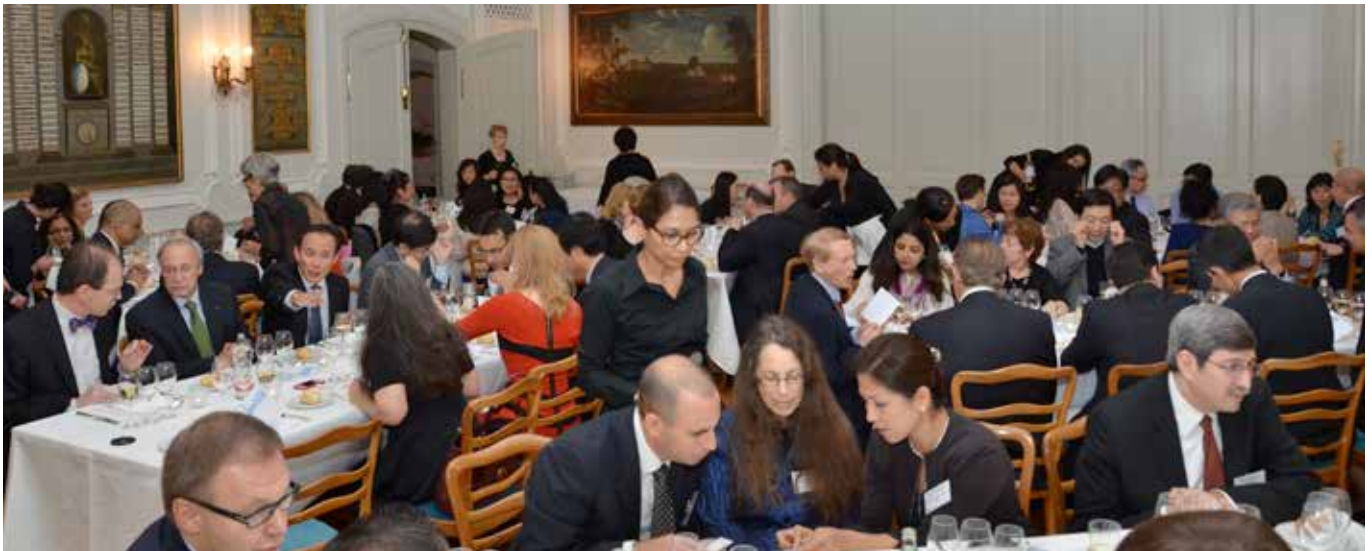
Become an IPBA Council member and you, too, can enjoy a delicious dinner in a sumptuous setting!