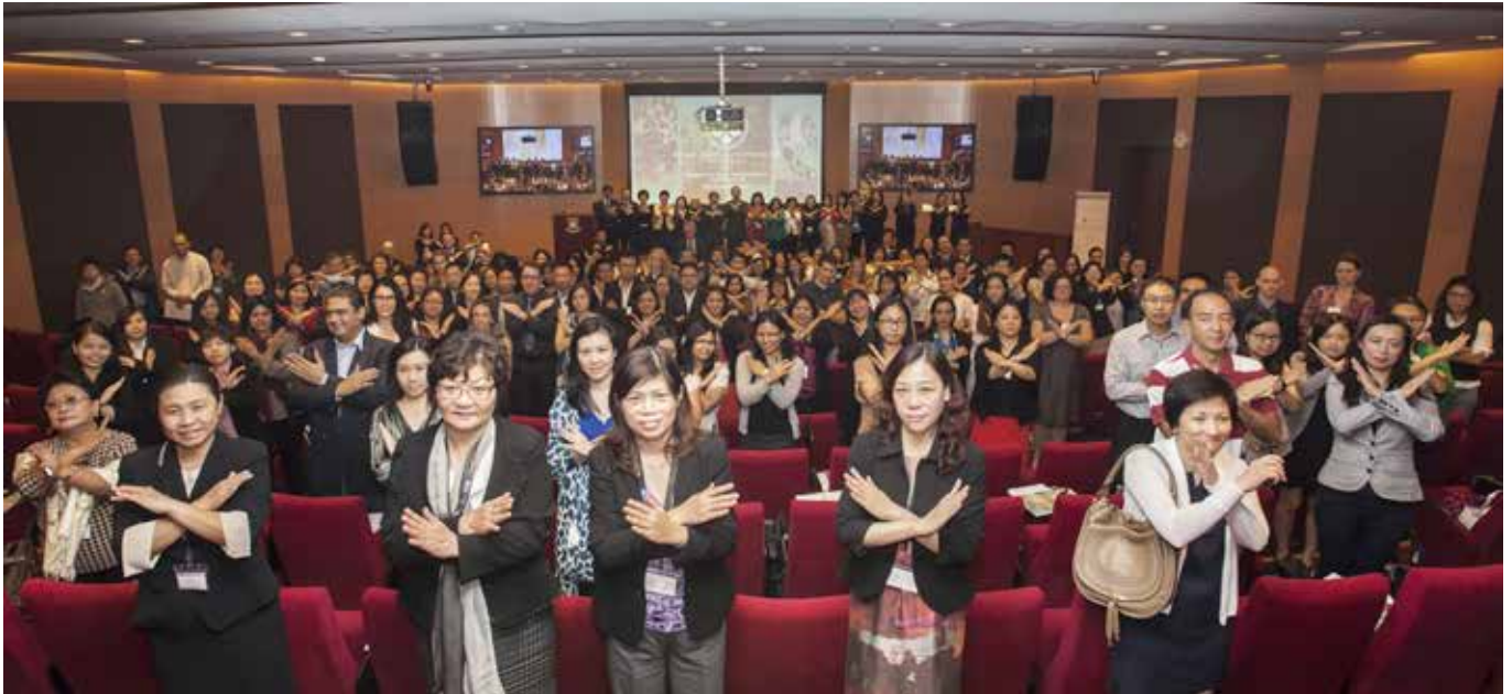
Participants of the conference doing the gesture to say 'no' to human trafficking.

trafficking and the need for a commitment to ending it. Despite international human rights treaties and protocols, multilateral agreements and national laws, the scourge of trafficking continues and the traffickers are rarely prosecuted. She stated that it is time to criminalise all forms of trafficking of persons, to strengthen laws and to bring justice to the offenders and intermediaries involved. We need to take more action to prevent trafficking and address its underlying causes, including wider efforts to increase education, create decent jobs and provide social services and protection. It is crucial to generate a pervasive culture of respect for human rights and to advance gender equality.