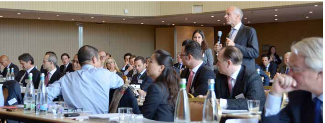
The Regional Conference attracted 120 delegates, who actively participated in Q&A.