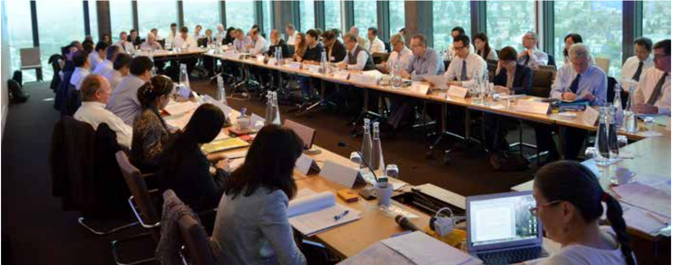
IPBA Council Members meet to discuss the business of the association, hosted by Zurich law firm Homburger.

leading to Switzerland's economic success and how these have been replicated and reflected in Asia. He ended on a warning note that while Asian countries have learned from Switzerland, it would do well for Switzerland to now also look to and learn from Asian countries going forward to ensure continued economic prosperity.