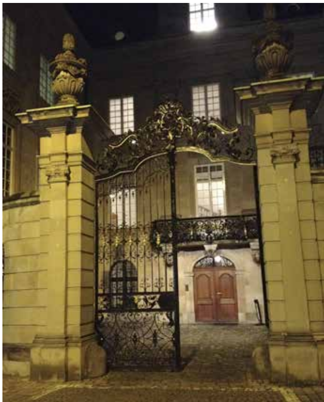
Entrance to Zunfthaus zur Meisen, guild hall of wine merchants, saddle makers and painters.